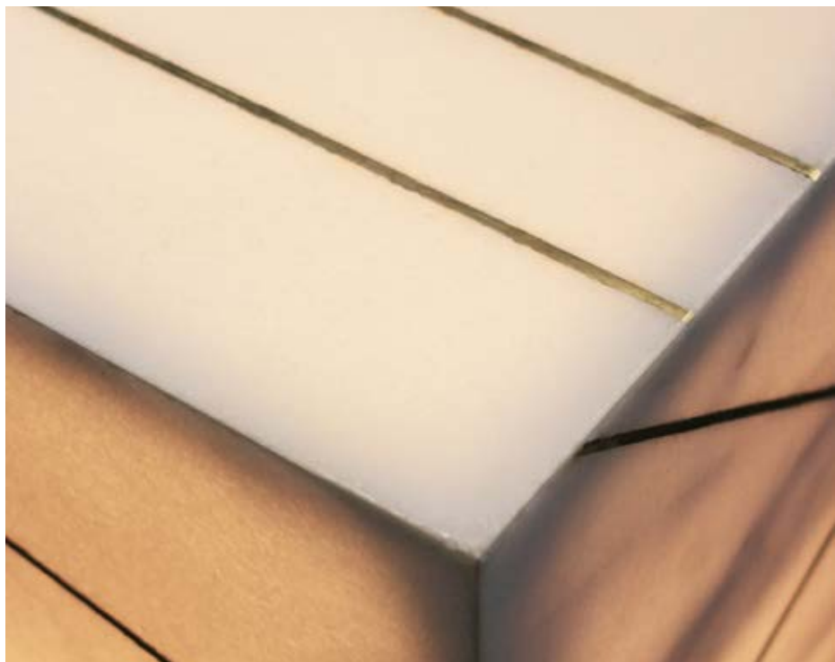
MATERIAL marble, brass LARGE SIZE 40 x 40 x 40 cm • 15.7" x 15.7" x 15.7" SMALL SIZE 20 x 20 x 20 cm • 7.8" x 7.8" x 7.8"