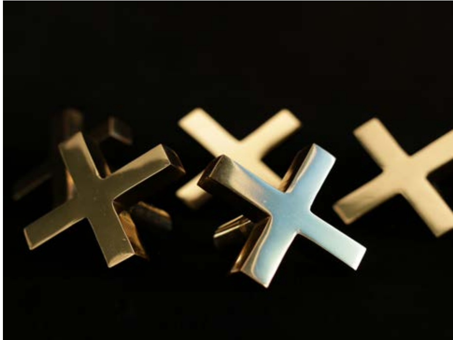
MATERIAL cast brass DIMENSIONS 6 x 6 x 4 cm • 2.3" x 2.3" x 1.5"